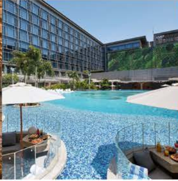
Significant discounts in NWR's five international hotel partners