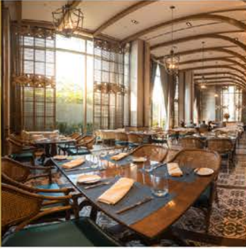
Daily vouchers to NWR's award-winning restaurants

Members reap these exclusive benefits and enjoy exclusive access to some of the most sought-after VIP events.