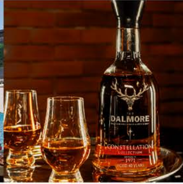
Private masterclasses featuring premier global brands Moët Hennessy, Kavalan Whisky, and Mars Iwai Whisky