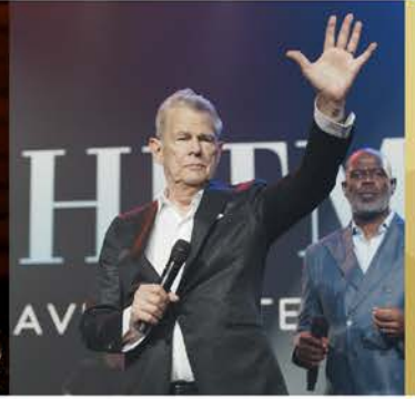
Star-studded David Foster concert attended by over 3,200 Epic Rewards members and VIPs from partner brands

Epic Rewards broadened its horizons in retail with Epic Points redemptions in over 70 partner merchants in NWR alone.